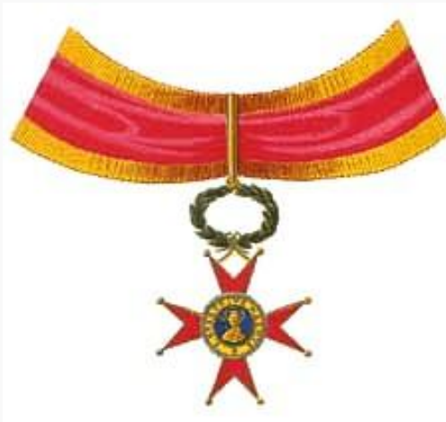
Knight Commander's cross of the Order of St. Gregory the Great (1841)